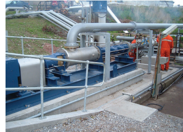
seepex pump range N

We worked with the refinery to take their concept design through to commissioning and successful operation of a seepex API 676 compliant progressive cavity pump. This project illustrates the strengths of the seepex progressive cavity pump, which can handle variable flow with a simple control philosophy and provide stable flow rates despite changing pressures. Low NPSHa can be resolved by careful pump sizing and seepex can manufacture in virtually any metallurgy. Comparisons with other technology highlighted many design benefits; including the requirement for only one mechanical seal, slow rotating shaft speeds which extend bearing and seal life, and the operational benefits of a smooth, quiet, slow running and robustly constructed pump.